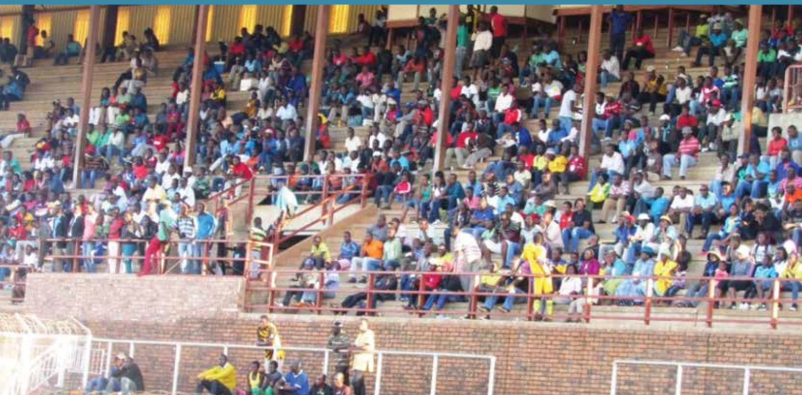
A section of the crowd that watched Mayoral Cup Games at Giyani Stadium recently.