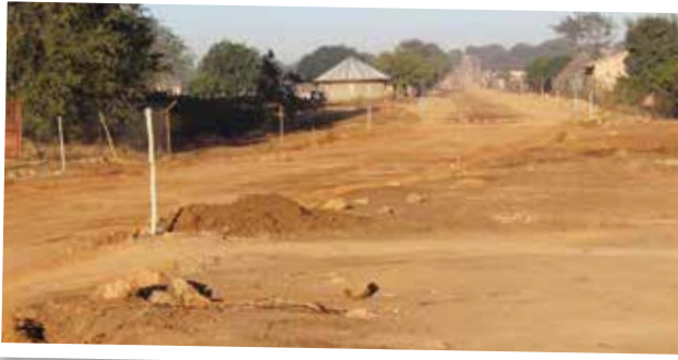
The construction of the Sikhunyani tarred road is under way.