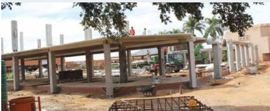
The construction of the new block of the Giyani Civic Centre is progressing well.