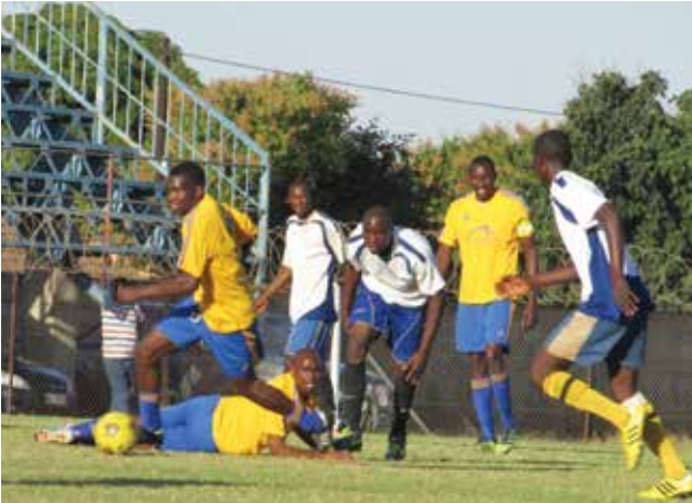
Giyani All Stars (in yellow kit) try to find a way past Mninginisi Mighty Stars’ defence. The Giyani outfit won the match 4-2 on penalties to lift the tournament’s trophy.