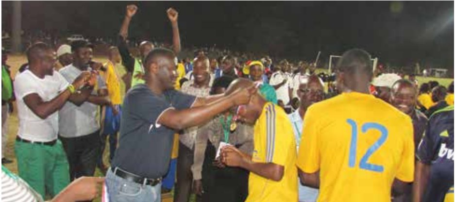
Greater Giyani Mayor hands out medals to Giyani All Stars players.