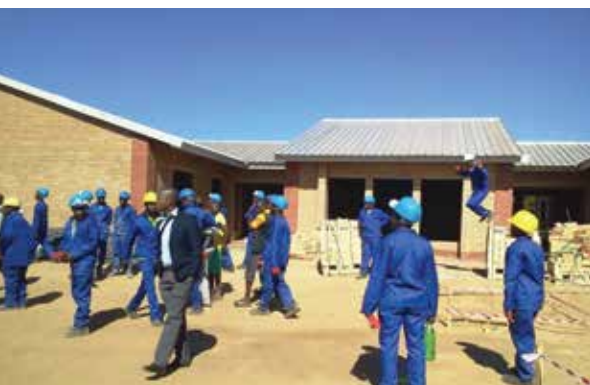
A clinic being built at Muyexe. It was one of the projects the president visited.