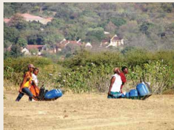
Vamanana va ka Siyandhani va huma eku keni ka mati exikolweni xa le henhla xa vurimi xa Kheto Nxumalo, kusuhi na Giyani.

Loko wu fika emakumu mati ya ta kumeka nkarhi hinkwawo emigangeni ya Greater Giyani, ku gimeta Meyara.