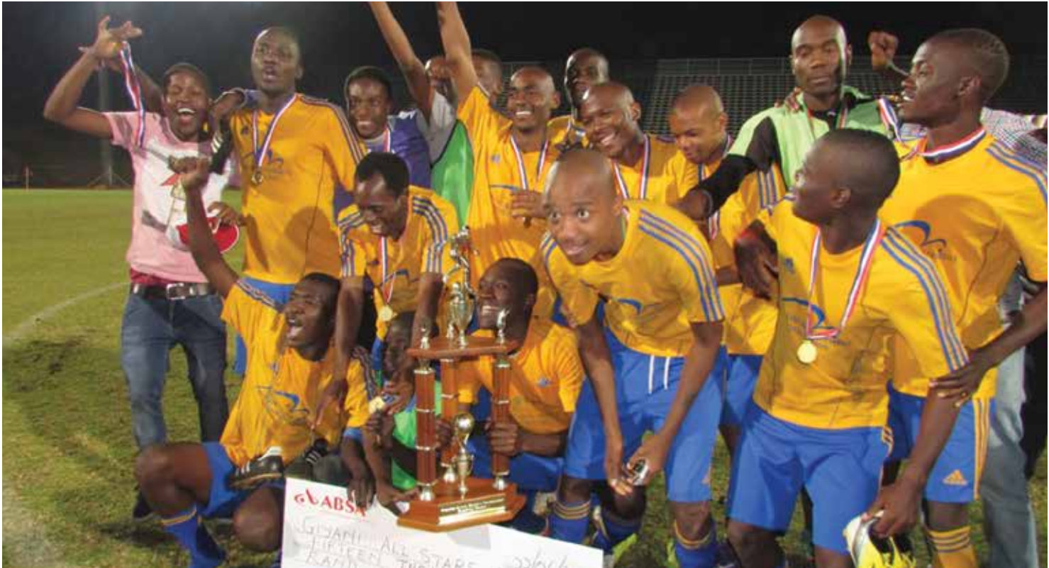
Giyani All Stars players celebrate after winning the Mayoral Cup.