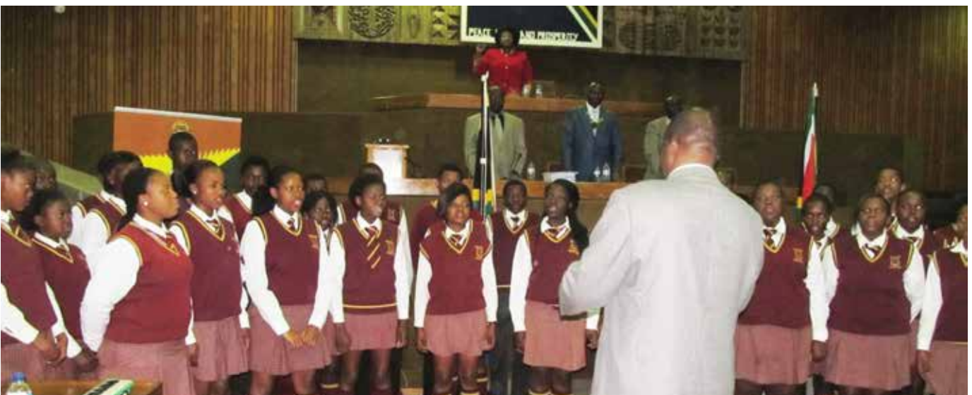
The Risinga High School Choir performs after the delivery of the 2013-2014 Budget Speech.

"We needed to have an operational framework within which we could interact with the committee members,"