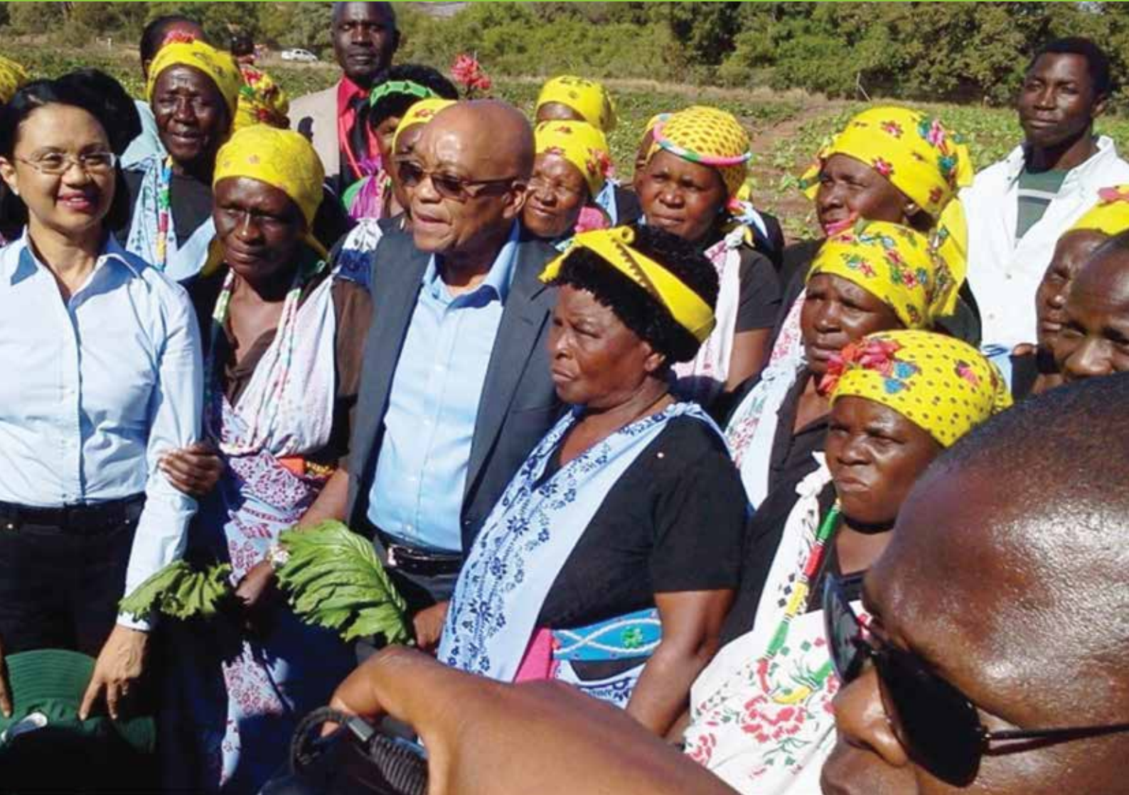
Some of the members of the Macena Gardening Project with President Zuma and Agriculture Minister Tina Joemat-Pettersson.