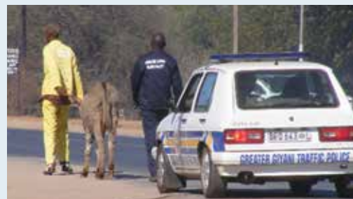
Greater Giyani municipal workers take a donkey to a pound after it was found wandering in the town's CBD.